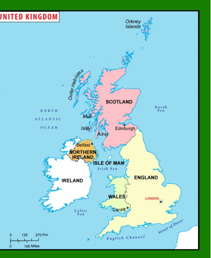
The United Kingdom