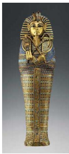
Tutankhamun's tomb was discovered by Howard Carter in 1922.