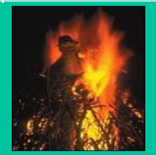
Guy Fawkes Night