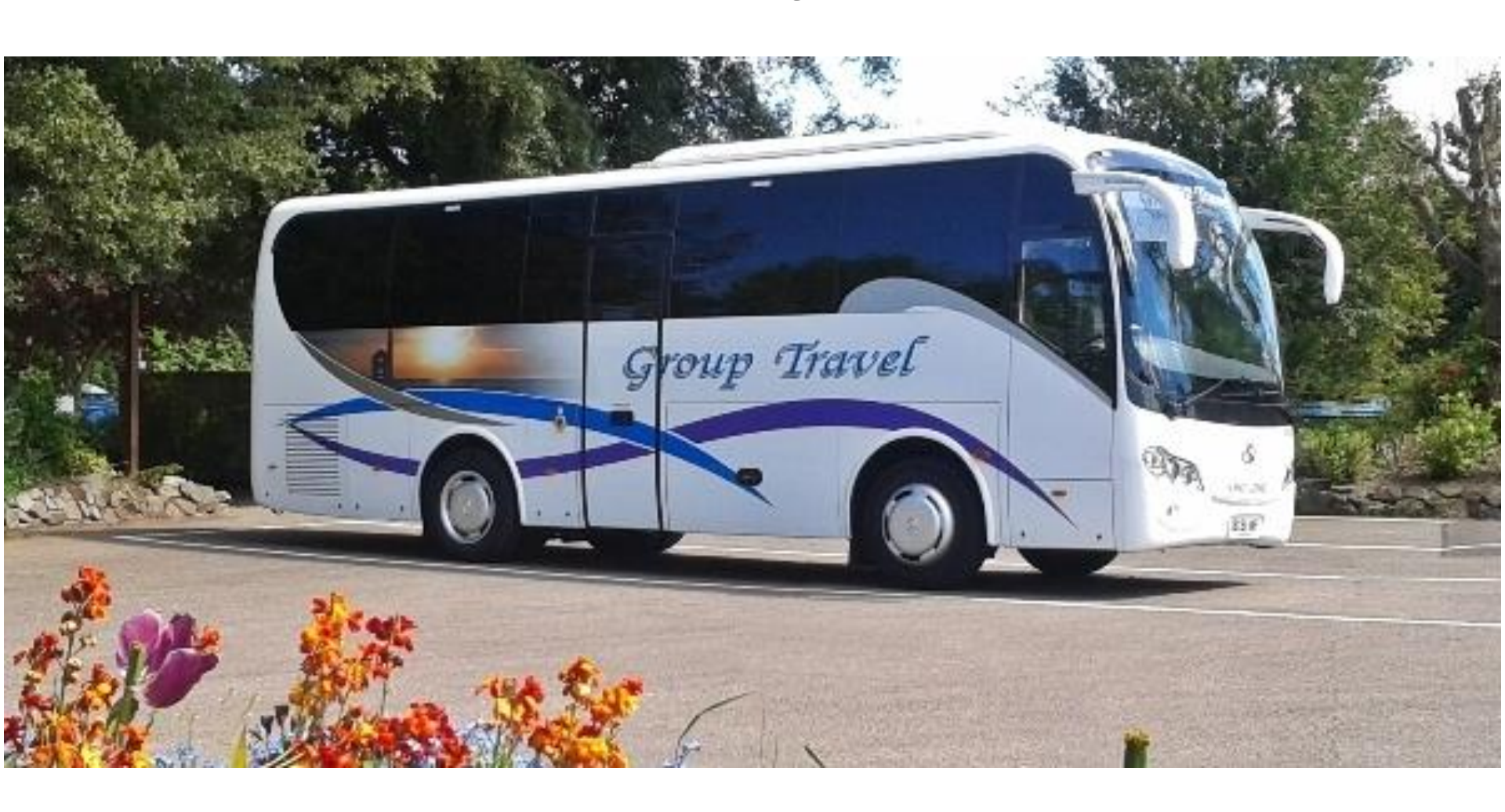
Stop for lunch