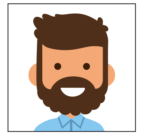
Jaz's Foster Dad

In our house, we switch off all our devices by 8pm. It's our family rule. We all do it.