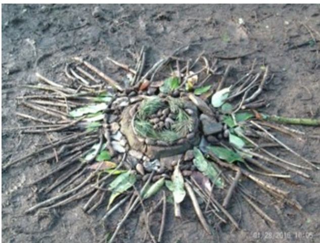
A group's Celtic Circle inspired by Andy Goldsworthy.

On Thursday 28 th January, Year Three enjoyed hosting a Forest School Trust event for St Stephens and St Catherine's. Although it was bitterly cold, the morning stayed dry, enabling an action packed morning of den building, treasure hunting, building an egg tower, creating art and not to mention fire building and marshmallow toasting.