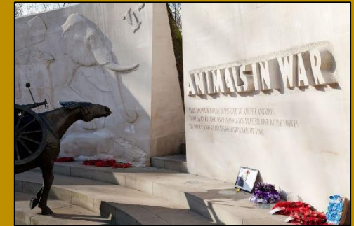
Animals in War Memorial, Hyde Park, London

Important ways life changed for children during the First World War